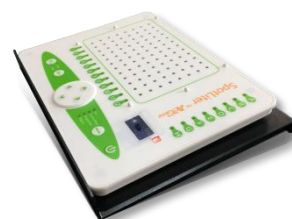
Fig 2. Stand of SpotLiter